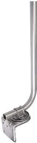
FIGURE 7. The SMMB1 Mounting Bracket

The SMMB2A provides a heavy-duty mounting solution for radio deployments. The SMMB2 is compatible with all Cambium PMP radios, and recommended for all Cambium PMP 400, Cambium PMP 320 Access Points and Cambium PMP 430 Access Points.