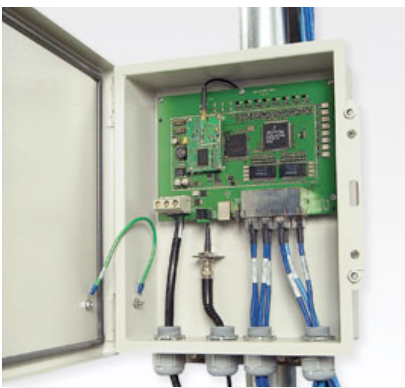
FIGURE 1. The CMM3

Cambium Networks' industry leading wireless broadband expertise helps to substantially reduce the effects of interference for Point-to-Multipoint wireless access and distribution networks in both licensed and unlicensed frequencies. The Access Point (AP) distributes network or Internet services in a sector for as many as 200 subscribers. A variety of accessories are available to work with the APs including the Cluster Management Modules, Universal GPS (UGPS) and power supplies.