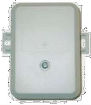
FIGURE 6. Surge Suppressor